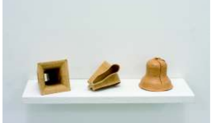
3 Corners 2008 plastic