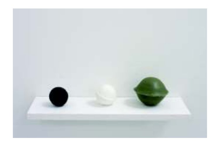
Ping-pong, Golf & Tennis 2008 modelling clay