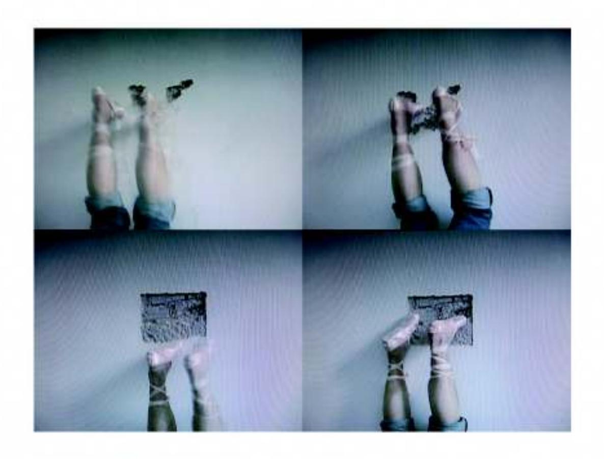
Wallworks I. DVD Dummy video 2 min loop 2006