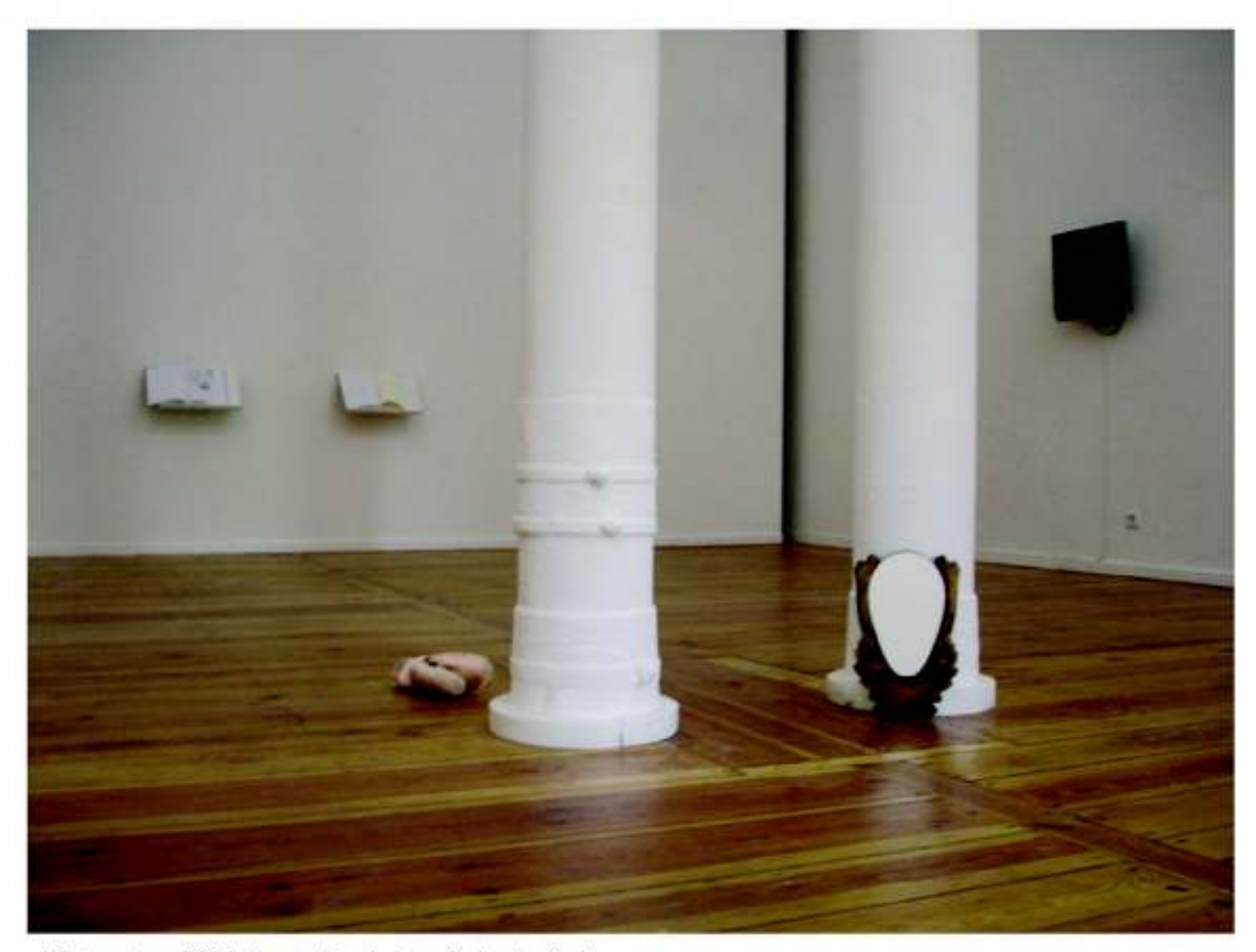
exhibition view , 2006 August, Künstlerhaus Bethanien, Berlin mixed media installation drawing books, small- scale sculptures, photos and videos incl. documentations of performances