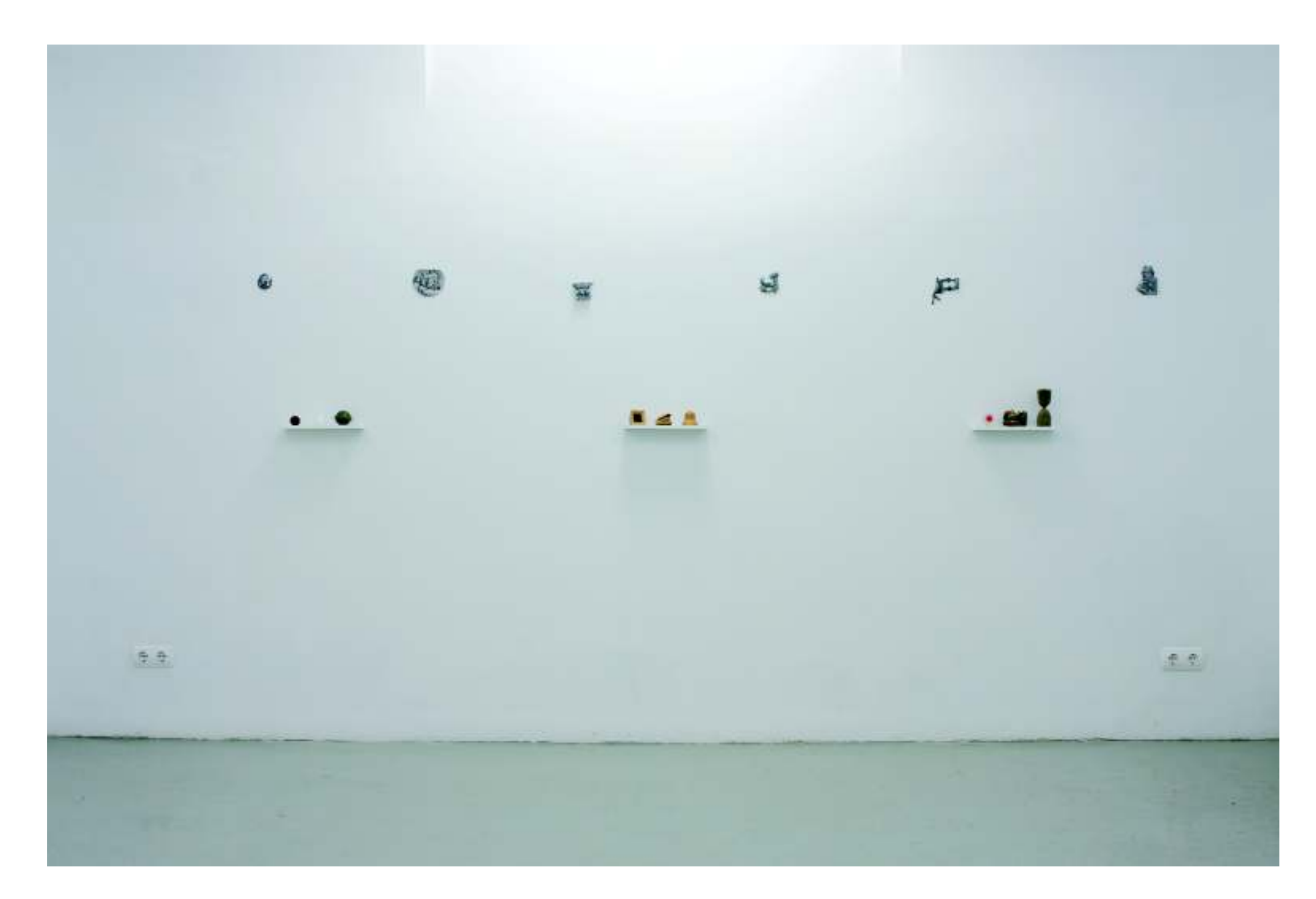
Indoor, Outdoor exhibition view 2008