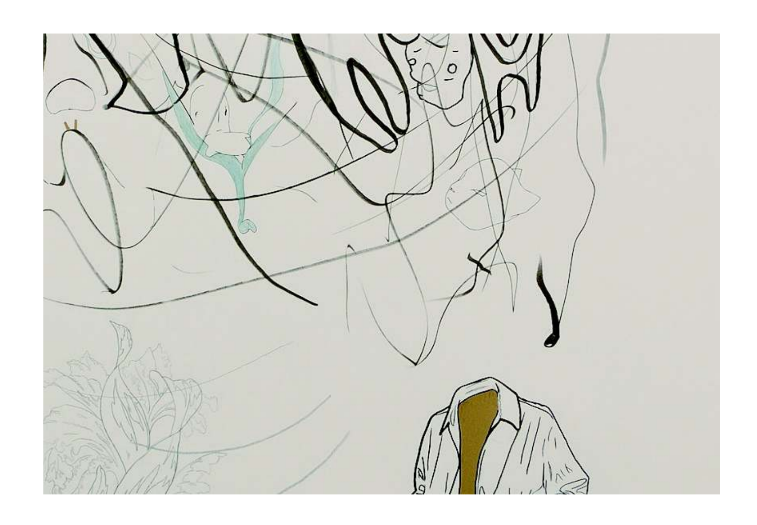
Drawing 2006 (detail)