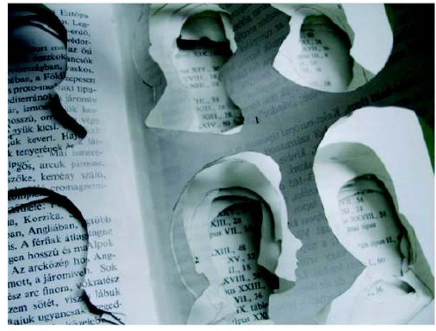
The Common Profile 2005 book on human races and cut-outs