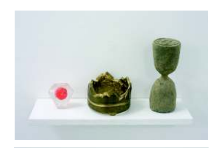
3 Consumer Objects 2008 mixed media