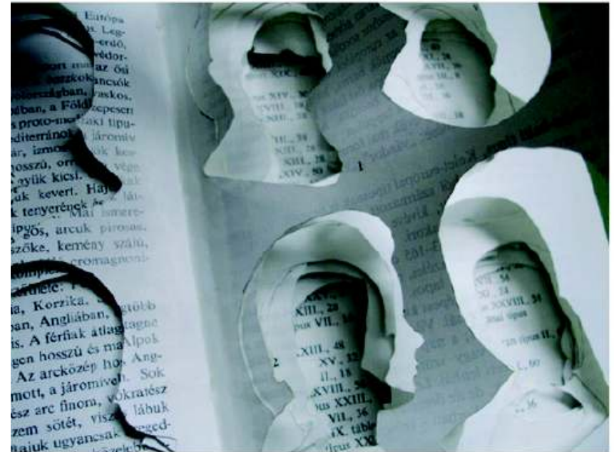
The Common Profile 2005 book on human races and cut-outs