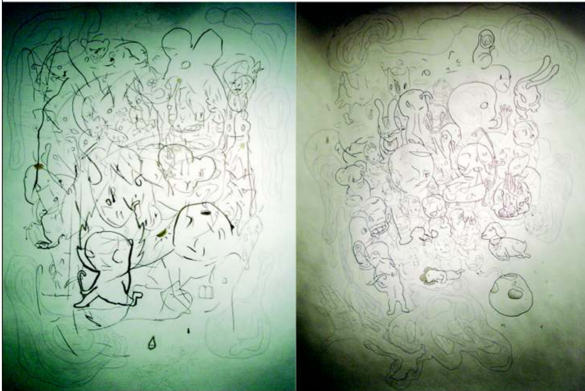
Bardo 2 drawings size 84x119 cm 2005.