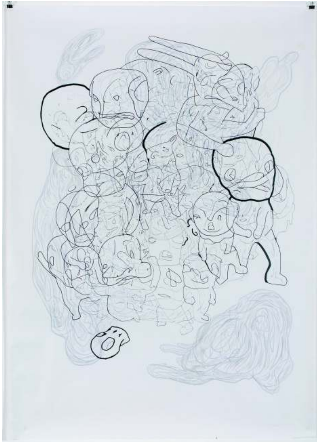
Drawing 2006 (mixed technique on paper) 101x71cm