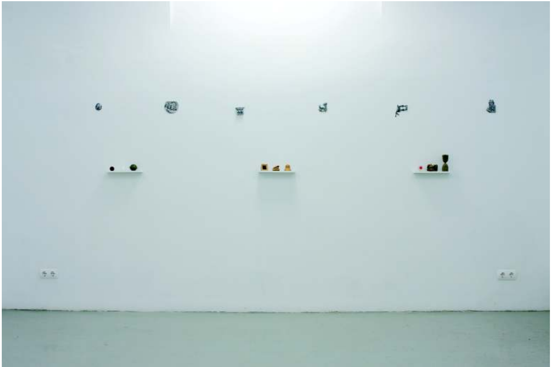
Indoor, Outdoor exhibition view 2008