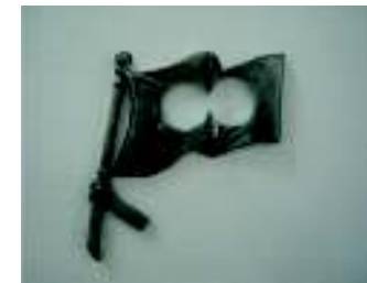
manipulated objects 2006 (metal, paint) various size