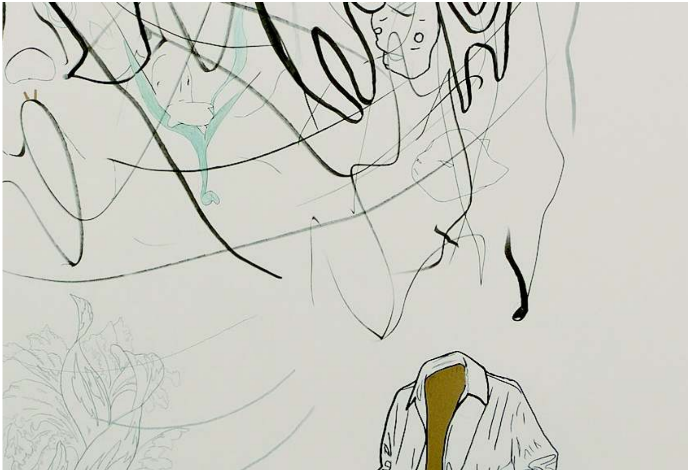
Drawing 2006 (detail)