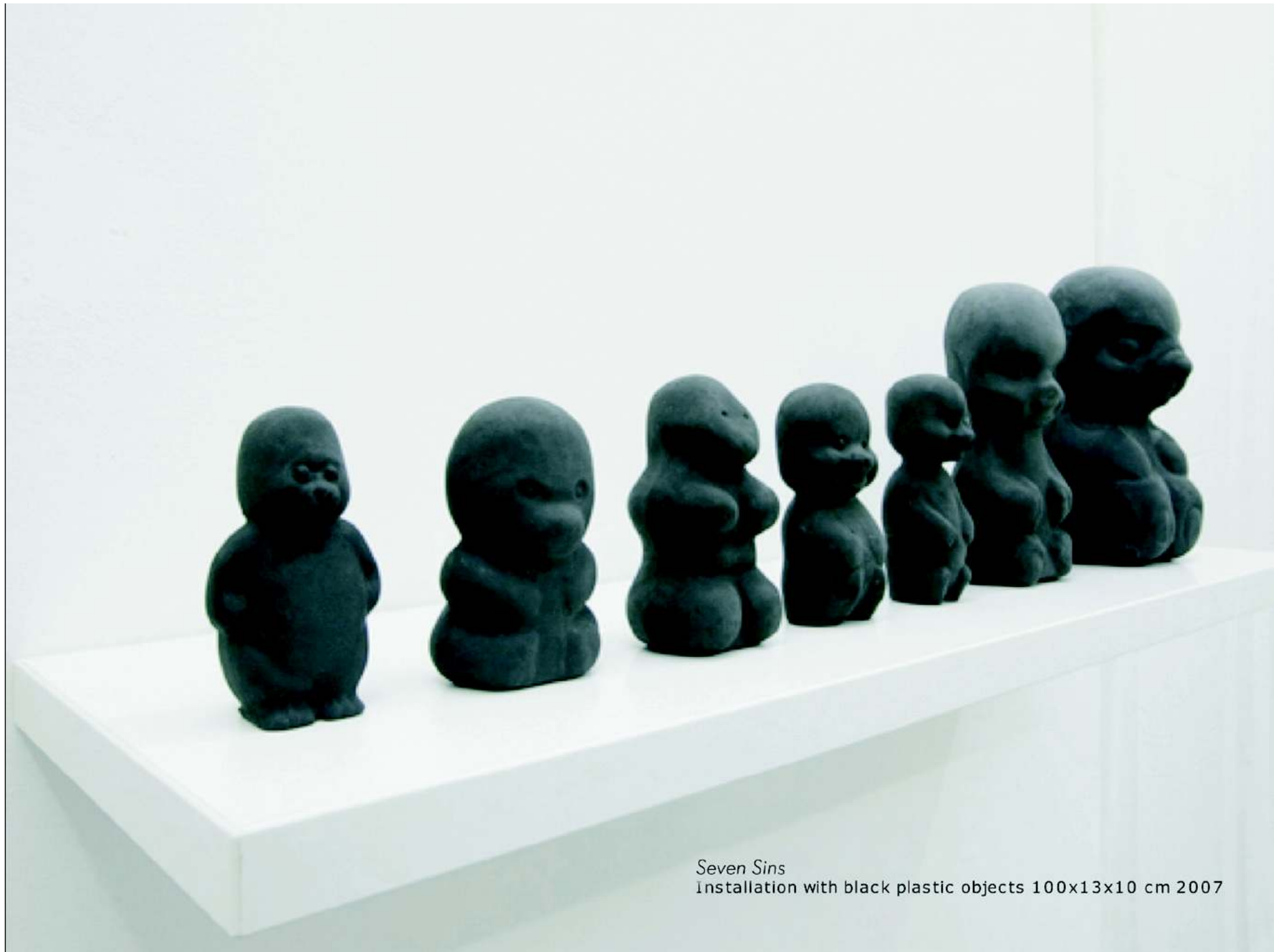
Seven Sins Installation with black plastic objects 100x13x10 cm 2007