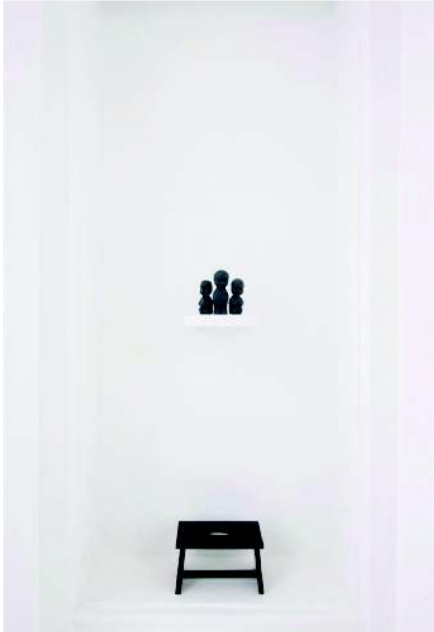
trinity 2007 3 figures, modelling clay