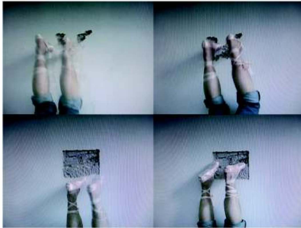
Wallworks I. DVD Dummy video 2 min loop 2006