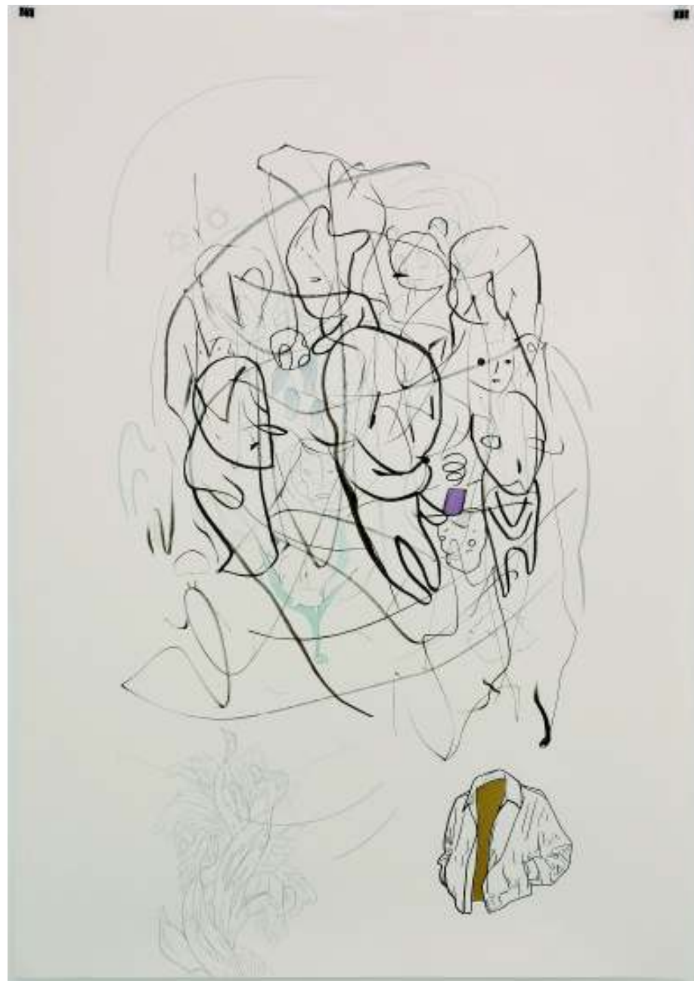
Drawing 2006 (mixed technique on paper) 101x71cm